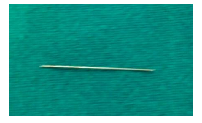
Figure 4: Removed broken needle.

An attempt was given for the surgical removal of broken needle in emergency operation theatre under local anaesthesia without the help of image intensifier but it failed. On the following day needle removal was done under spinal anaesthesia with the help of image intensifier. An incision was made at the injection site. Skin subcutaneous tissue was separated. A long artery forceps was used to locate the broken needle using image intensifier (Figure 2 and 3). Needle was found to be present deep within the muscle fibres of the gluteus maximus muscle. Needle was identified and removed (Figure 4). Wound was stitched in layers. Aseptic dressing done.