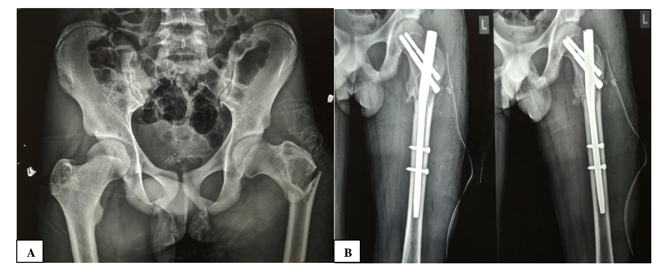
Figure 2: (A) Aneurysmal bone cyst with pathological fracture in left femur in a 16 year old boy; (B) fixation of pathological fracture with short PFN and packing the cavity with hydroxyappatite crystals.