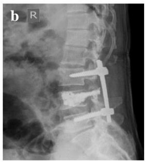
Figure 2: (a) Pre-operative sagittal MRI T1-weighted image of whole spine appearing hypointense on T1W mostly suggesting atypical haemangioma and (b) post-operated lateral view of lumbosacral spine.

Patient needed laminectomy and discectomy at multiple levels and also needed treatment for the atypical vertebral hemangioma. As a first step, spinal fusion procedure was done for L2, L3 and L4 vertebrae by using 4 pedicle screws (2 monoaxial screws of size 6.5×40 mm) and (2 polyaxial screws of size 6.5×40 mm) in pedicles of L2 and L4 vertebrae.