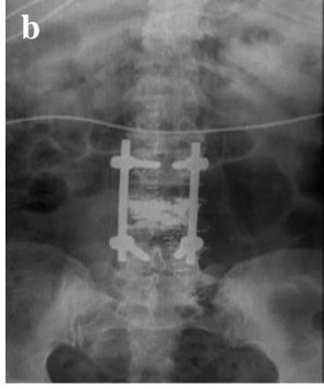
Figure 1: (a) Pre-operative X-ray showing vertical striations in L3 vertebra in lateral view and (b) post-operated anteroposterior view of lumbosacral spine.