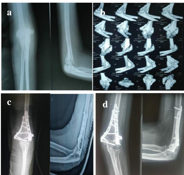
Figure 2: 22 years old with intraarticular fracture distal humerus AO type C1 operated through triceps reflecting approach; (a) pre-operative X-ray, (b) pre-operative CT with 3D reconstruction, (c) immediate post-operative X-ray, and (d) 1 year follow up X-ray.