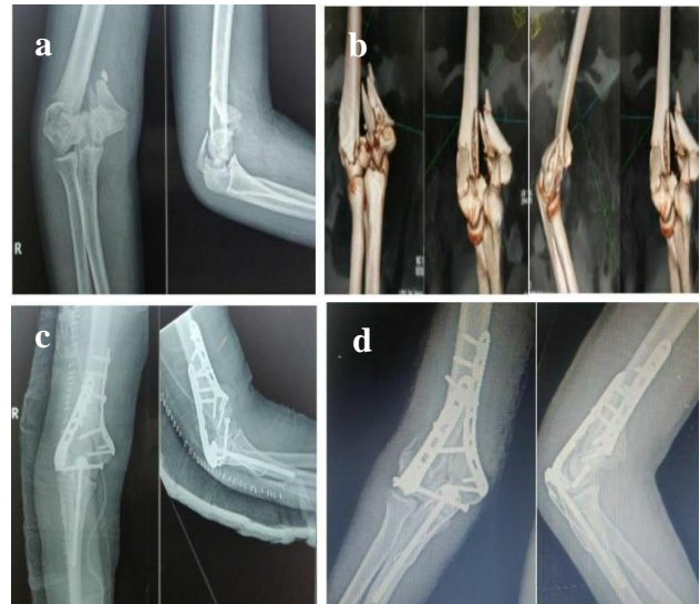
Figure 3: 47 years old with intraarticular fracture distal humerus AO type C3 operated through transolecranon approach; (a) pre-operative X-ray, (b) CT scan 3D reconstruction, (c) immediate post-operative, and (d) follow X-ray.