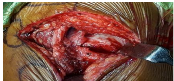
Figure 1: Rotator cuff tear.

After acromioplasty, rotator cuff tear was identified (Figure 1). Mobilization of the cuff was started posteriorly with the infraspinatus, using a blunt probe or a finger to release adhesions inside and outside the joint, and continued anteriorly to supraspinatus. If the supraspinatus and infraspinatus tendons were retracted so far that adequate length cannot be obtained with tendon mobilization, the capsule was incised at its insertion into the glenoid labrum. The end of the mobilized tendon was debrided to obtain a raw edge, taking care not to confuse the tendon with the overlying bursa.