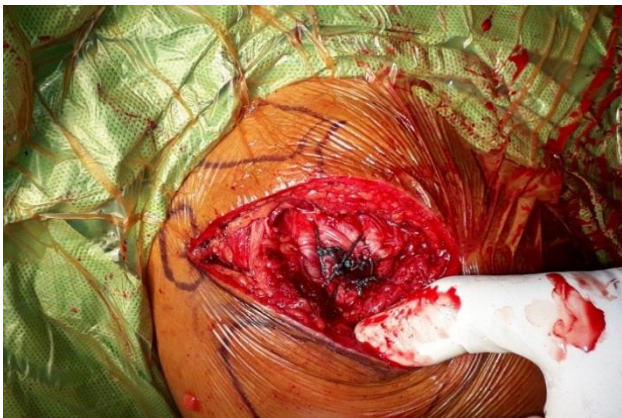
Figure 2: Rotator cuff tear post repair.

The deltoid was then sutured with periosteum through drill holes into the acromion with nonabsorbable, ensuring that the reattachment is secure. The wound was then closed in the usual manner after attaining hemostasis.