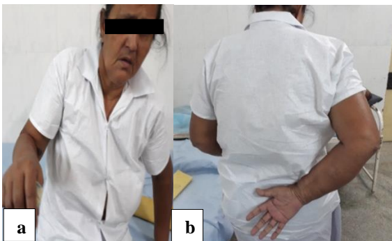
Figure 4: (a) Pre-op abduction and (b) pre-op internal rotation.