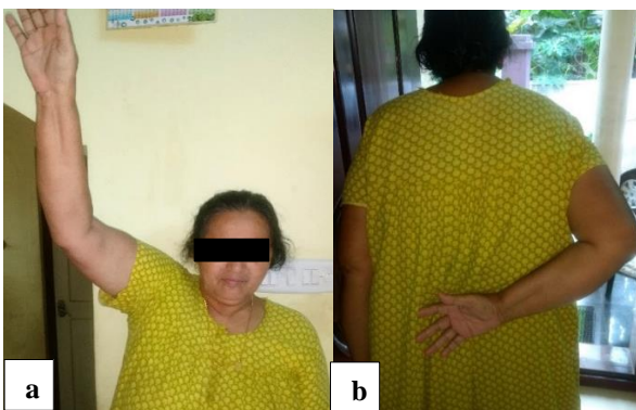
Figure 5: (a) Post-op abduction at 6 months and (b) post-op internal rotation at 6 months.