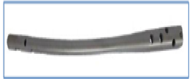
Figure 1: Retrograde femoral nail.

Femoral fractures are a common obstacle in orthopaedic trauma. There can be various types of fractures including proximal, diaphyseal and distal region fractures. There are various methods for treatment of femoral fracture viz. skeletal traction, bone plates, intramedullary nailing, rehabilitation. However, more frequently femoral fractures are seen to be treated with intramedullary nails, such as gamma nails, proximal femur nailing anti-rotation, and retrograde femoral nails (Figure 1-4).