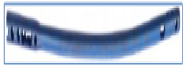
Figure 3: Universal intramedullary cannulated femoral nail.