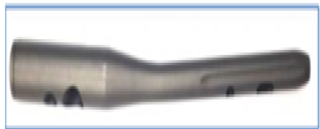
Figure 4: Gamma nail.

Major complications like infection, irritation, and implant failure have been reported by previous studies with the use of intramedullary nails. In our study, intramedullary nail was used and there were 32 patients, among which none had complaint about pain, infection, or irritation at the final follow up. No complication was obtained at final follow up. There was a small difference between VAS score of the both groups. The VAS score has shown good acceptance outcomes. So, the gold standard for treatment of femoral fracture is intramedullary nail. If we consider for full weight bearing, it has been suggested that intramedullary nail fixation is of first choice, regardless of any factor in treating femur fractures. 3,4