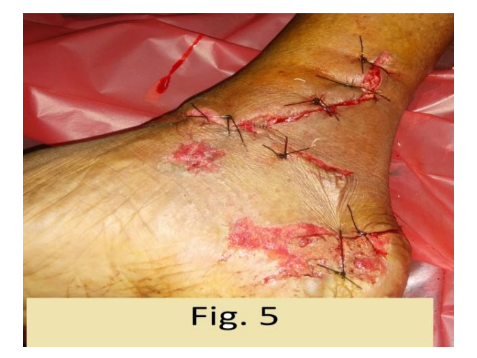
Figure 5: Stay sutures applied after through wash.