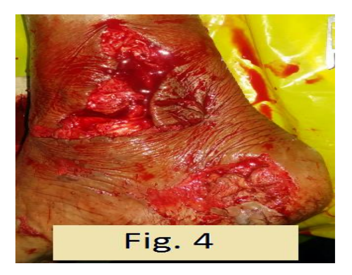
Figure 4: Post reduction image of right ankle.