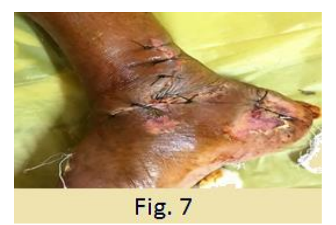
Figure 7: Wound status of right ankle joint five days after injury.

Check x-rays were taken to assess the reduction as well stability of the ankle joint (Figure 6).